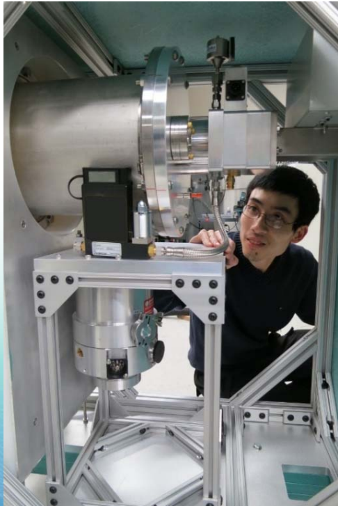
Fast Neutron Generator Head