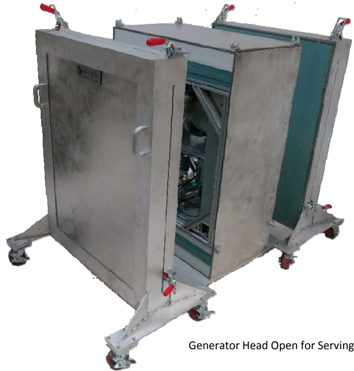
Generator Head Open for Servicing

Moderating to thermal energies permits activation of many isotopes and makes the generator useful for materials analysis and identification. The generator has a high thermal neutron flux and so is a good source for Neutron Activation Analysis (NAA) and Prompt Gamma Neutron Activation Analysis (PGNAA). This moderated source closely mimics experimental research reactors, which have previously been the primary sources of thermal neutrons that can be used for NAA and PGNAA. Furthermore, the source can be pulsed or gated to minimize the noise background. This can be helpful for delayed neutron activation analysis.